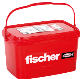
S in bucket